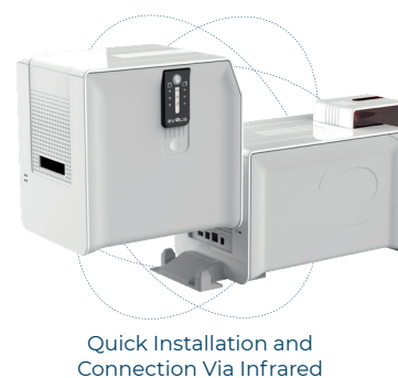
Quick Installation and Connection Via Infrared